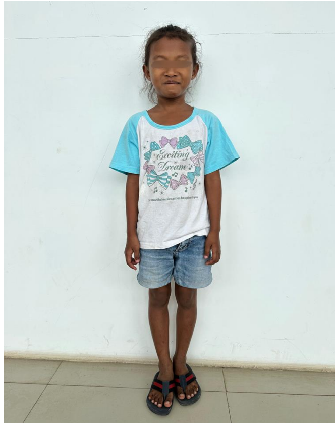
Figure 1. Stature of Patients with Hashimoto's Thyroiditis

with iron or calcium supplements, aluminum hydroxide, and proton pump inhibitors to avoid suboptimal absorption. Best taken in the morning with empty stomach for optimal absorption. The standard dose around 1.6 - 1.8 \text{mcg}/\text{kg} per day. Laboratory monitoring should be carried out every 2 months after a change in levothyroxine therapy until the appropriate dose is found and further monitoring can be carried out every 6 months. 3,9 In this patient, it was started with a low dose, namely given with an initial dose of 1 \text{mcg}/\text{kg}/\text{day} , which was then increased the dose during the second control for 2 \text{mcg}/\text{kg}/\text{day} .