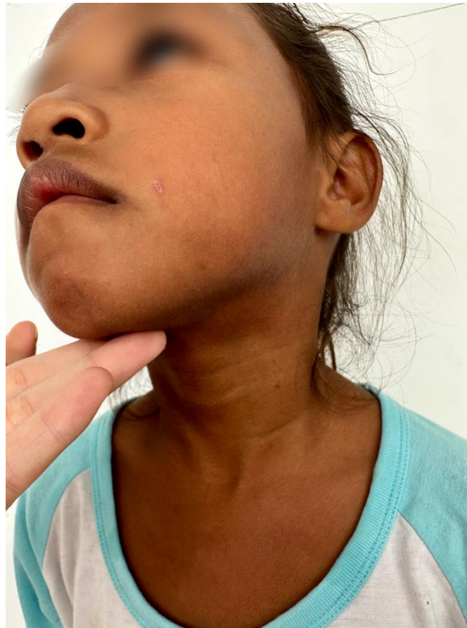
Figure 2. Clinical Photograph of a Patient with Hashimoto Thyroiditis