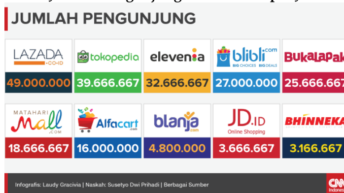
Figure 1.3: Jumlah Pengunjung E-Commerce per Januari 2017

unfavorable reviews about Tokopedia shared by someone. And this is possible to impact the decline in consumers who will do repurchase intention on Tokopedia. That is because many other e-commerce applications are not inferior to Tokopedia. Figure 1.3, shows that Tokopedia has the second largest number of visitors after Lazada. Still, if many Tokopedia consumers see negative reviews from other Tokopedia consumers, it is most likely to switch to other e-commerce applications, making Tokopedia consumers' repurchase intention level low.